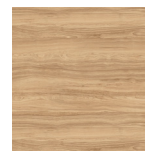
Fawn Cypress (FC)