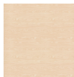
Manitoba Maple (MM)