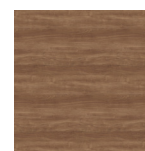
Pinnacle Walnut (PW)

376 Martin Avenue, Santa Clara, CA 95050 Phone: 408.437.8770 | Website: www.hatcontract.com Send orders to: orders@hatcontract.com